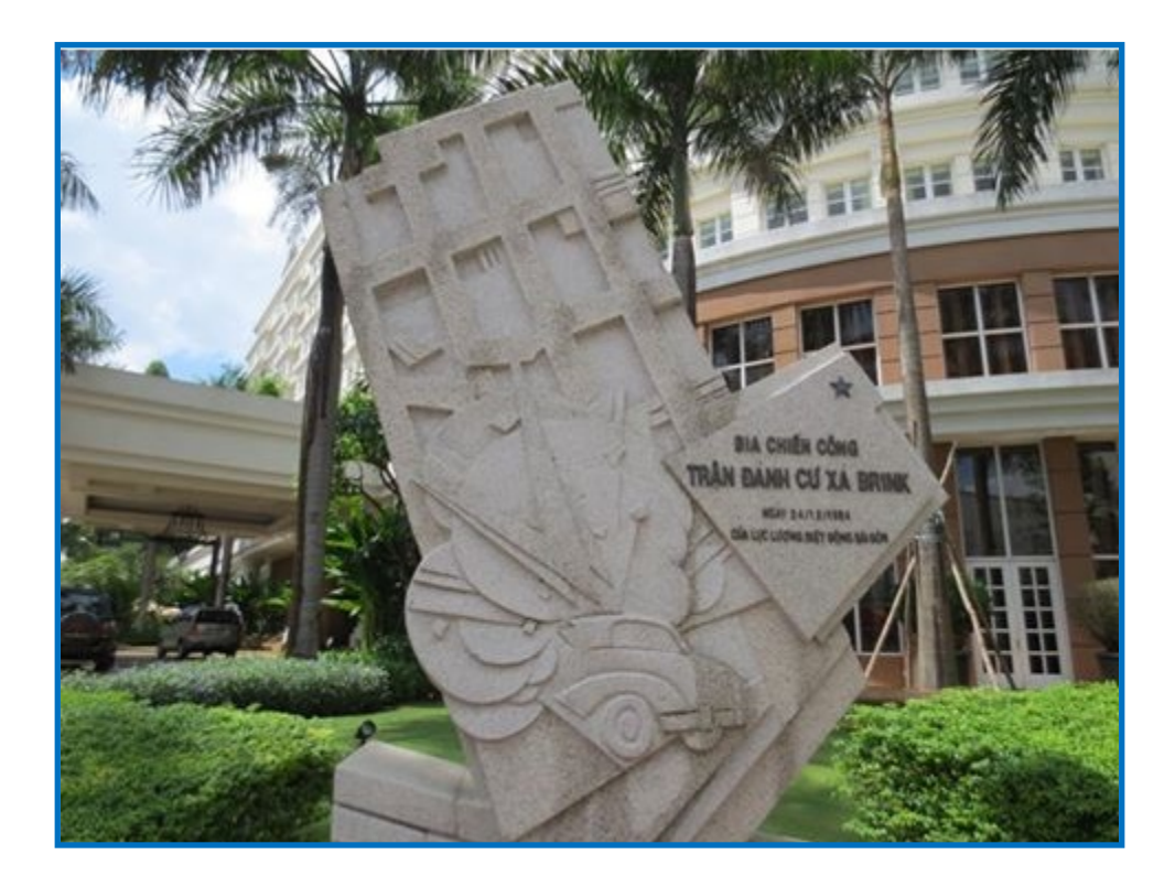
The Memorial to the Brink Hotel bombing as of 2015.