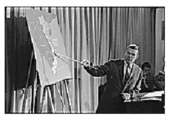
Secretary of Defense Robert S. McNamara's February 1965 press conference at the Pentagon. (Photo taken February 7, 1965.)