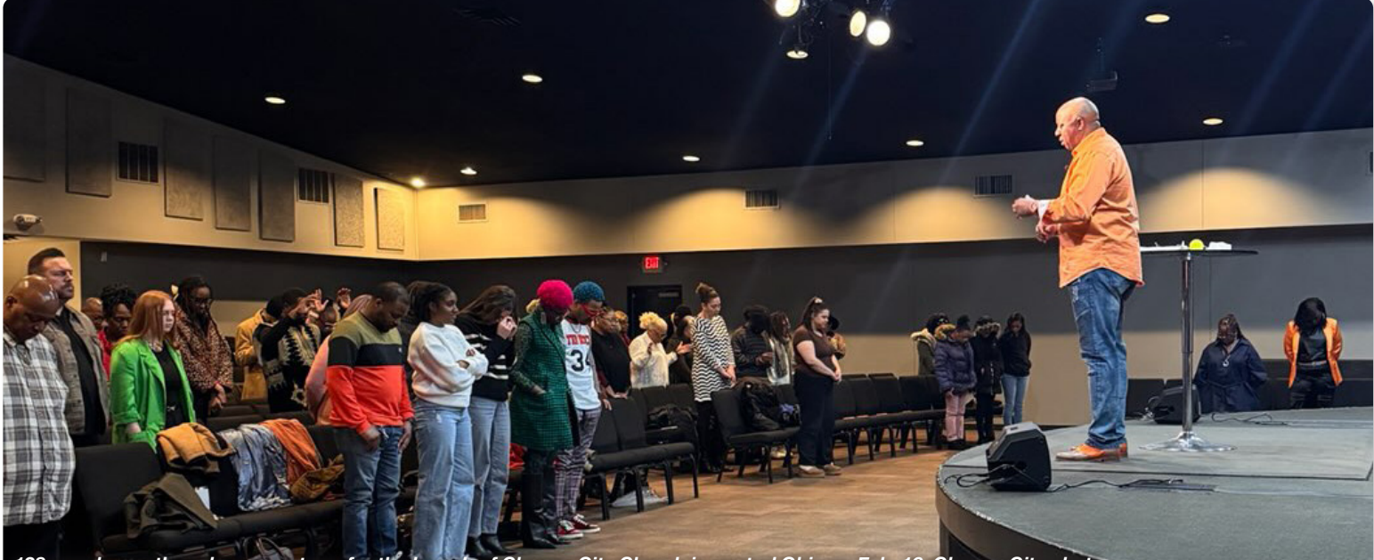
128 people weathered a snow storm for the launch of Change City Church in central Ohio on Feb. 16.

Network Planter By Diana Chandler, Baptist Press senior writer