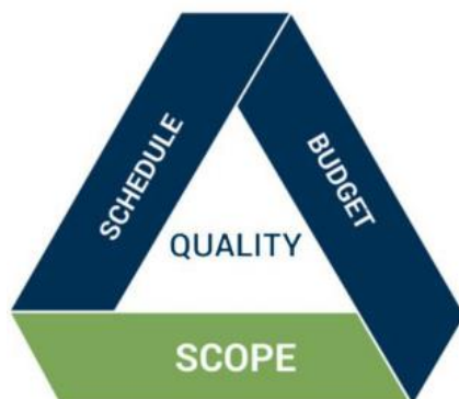
Figure 7. Triple Constraint