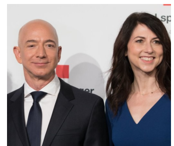
Jeff and Mackenzie Bezos