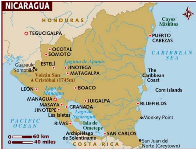
Map of Nicaragua Where Walker Executes His Filibuster

Some 2,800 miles south of Kansas events during the Fall of 1855 are playing out in the country of Nicaragua that further testify to Pierce’s inaugural promise to avoid “timid forebodings” about geographical expansion.