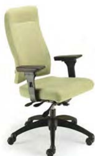
8002 A : 20" C : 17 - 21" E : 24"