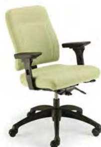
8001 A : 20" C : 17 - 21" E : 18 1/2"