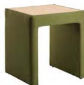
8000 T A : 17" C : 18 1/2"