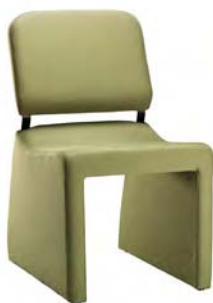
8000 A : 20" C : 19" E : 17"