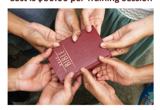
Note: All participants are asked to have a letter of recommendation from their pastor and/or deacon chair.