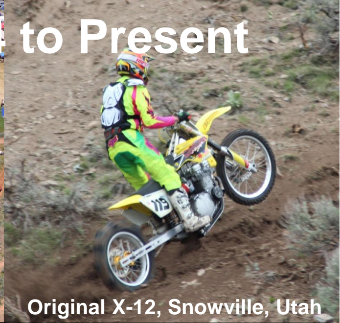
Original X-12, Snowville, Utah

The new X-12 Hillclimb is located off of I-15, about 10 miles north of Tremonton, just behind Nucor Steel. It has some similarities to the original Widowmaker, since it also runs on and crosses some old Lake Bonneville benches, and the hills are similar in size to the old Widowmaker. Actually, the new X-12 has the highest, longest hills in the entire world of hillclimbing. It started at its new home in 2018; may it live long and prosper as Utah's only hillclimb.