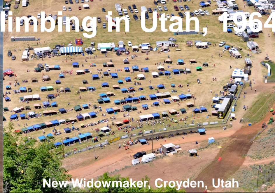
New Widowmaker, Croyden, Utah

The Utah Klunker Club ran a hillclimb on a short hill above Brigham City from about 1965 to 1991. It was never as big of an event as the Widowmaker, but for several years it was Utah's ONLY hillclimb.