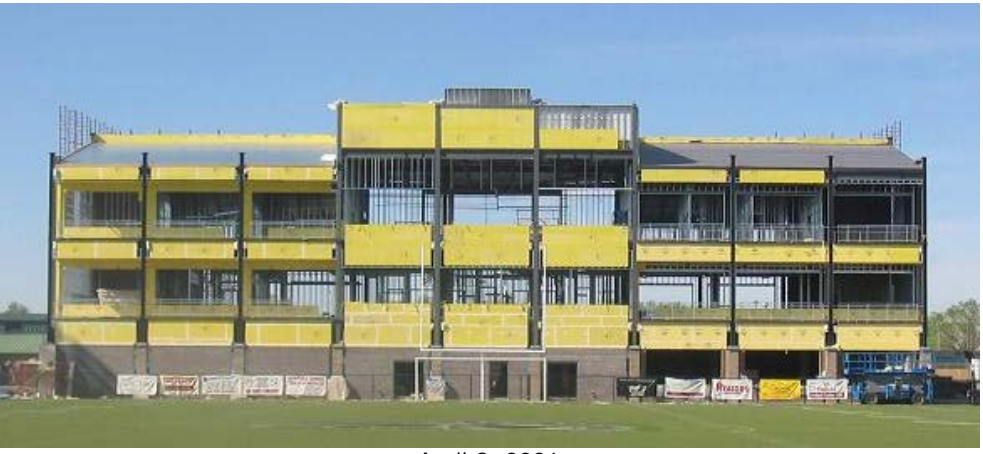
April 8, 2006