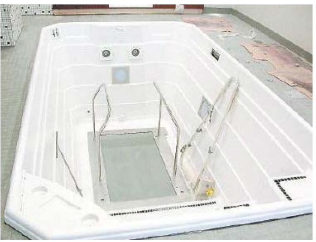
Jenks High School constructs new $5 million fitness center

BY DAVID SCHULTE Tusla World Staff Writer