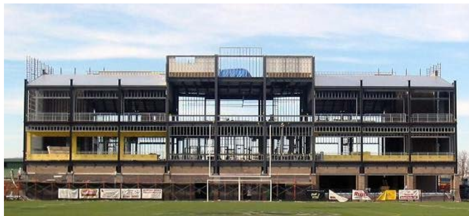
March 27, 2006