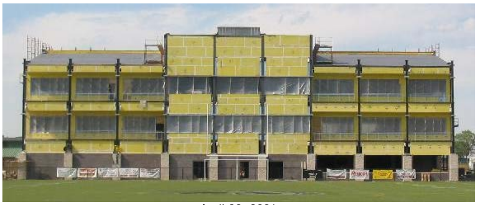
April 30, 2006