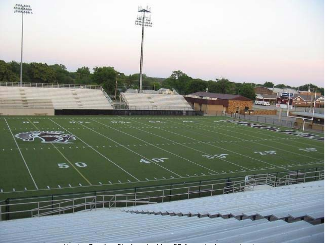
Hunter Dwelley Stadium looking SE from the home stands.