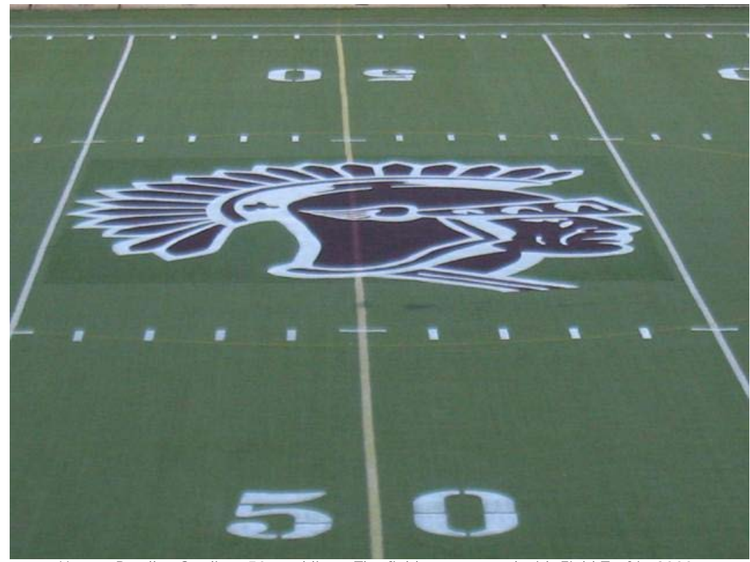
Hunter Dwelley Stadium 50 yard line. The field was covered with Field Turf in 2000.