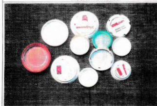
Medicine Bottle Caps with any cardboard inserts removed