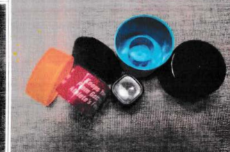
Hair Spray, Paint & Deodorant Caps