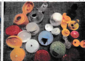
Flip-top caps (ie: Ketchup, Mustard, Creamer tops)