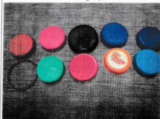
Milk Jug Caps