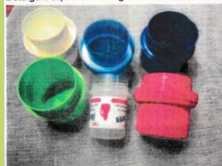
Detergent Caps with white gasket and label removed