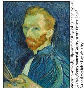
Van Gogh and Britain

Tate Britain, London, UK, until Aug 11, 2019 https://www.tate.org.uk/whats-on/tate-britain/exhibition/ey-exhibition-van-gogh-and-britain