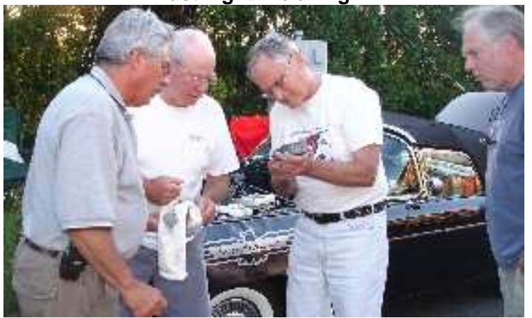
Some minor carb work