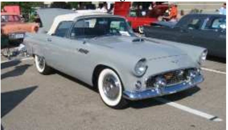
Donna's car waiting for the judges