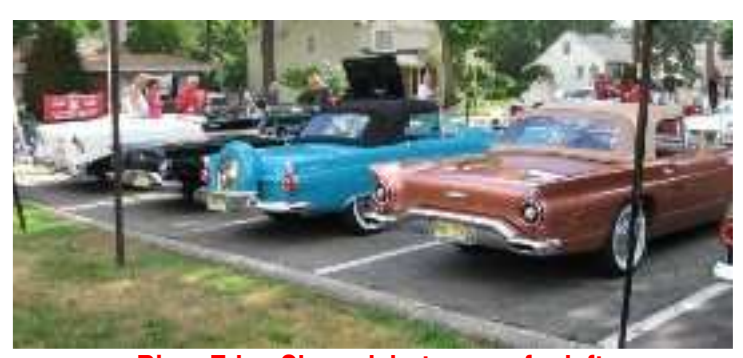
River Edge Show-debut car on far left

If any one has info on shows and swap meets please let me have the particulars for the newsletter.