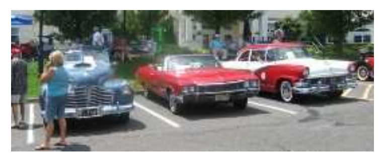
You can't build a reputation on what you are going to do (Henry Ford)