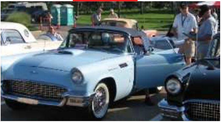
Pat being judged