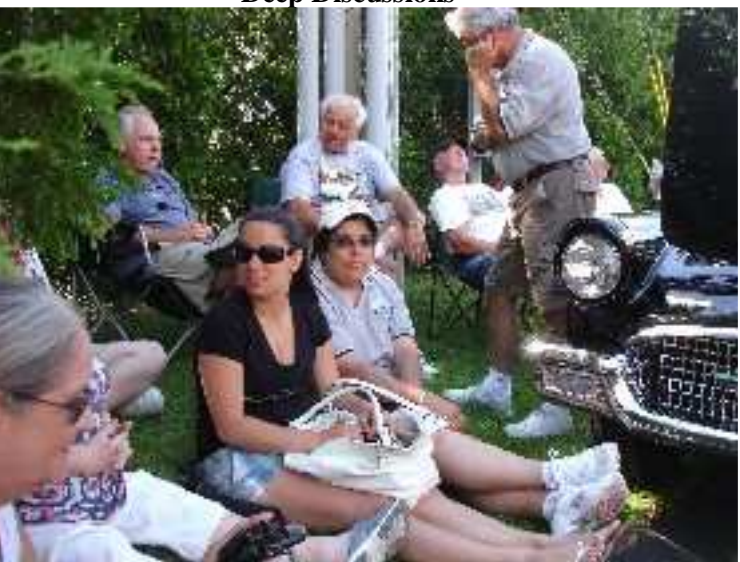
Last night - relaxing