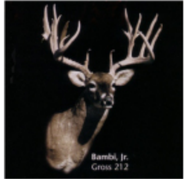
Bambi, Jr. Gross 212