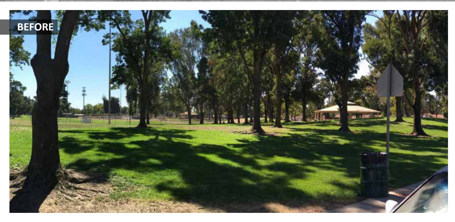
The existing project site has earth mounds that will aid in the building of the new playground. (Above) The proposed entry to this destination playground will be on the Northeast side of Beyer Park and will be redesigned with accessible parking and a fun new look! (Right)

The Awesome Spot playground was designed around a nature theme transporting children into a rain forest, swamp, and savanna where creativity alone limits the fun.