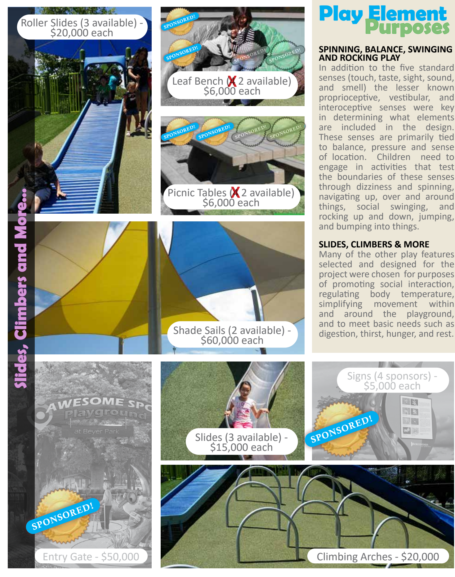
Other play equipment is also available for purchase. Contact a project member for additional info.