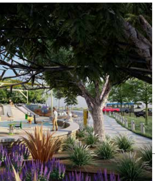
View of Swamp Cruise from the Picnic Area