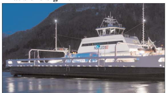
Another use of big Li-ion batteries is in

both running and recharging electricallypowered ferries in Norway. The ferries run between the villages of Lavik and Oppedal in the Sognefjord. The ferries, each 80 meters long and 20 meters wide, transport up to 120 cars and 360 passengers 6 km across the fjord 34 times per day, with each trip requiring around 20 minutes. Each ship carries a tenton, 1000 kWh battery that can provide enough energy for about two trips. Recharging in the ten minutes the ship spends at the dock at each end would overtax the local electrical grid, so each ferry terminal has a 260-kWh battery that provides a quick boost and is itself recharged while the ferry is under way. The ship's batteries are fully recharged directly from the grid at night after the ferry stops operating.