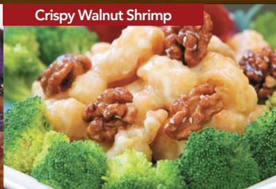
Crispy Walnut Shrimp