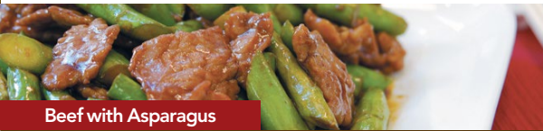
Beef with Asparagus

Chicken breast, organic wild mushrooms, snow peas and carrots stir-fried in brown sauce 18.49