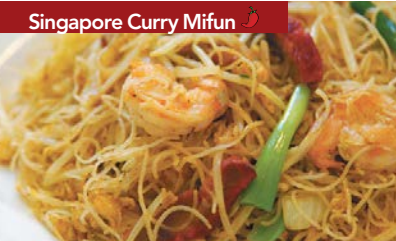
Singapore Curry Mifun 🍲