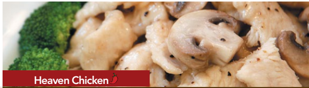
Heaven Chicken 🍲