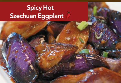
Spicy Hot Szechuan Eggplant 🌶️