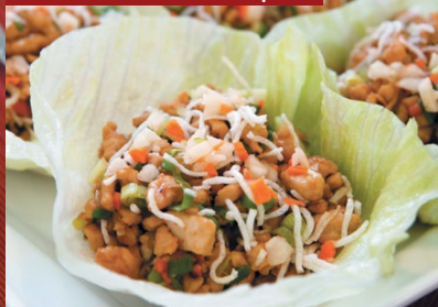
Chicken Lettuce Wrap