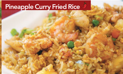
Pineapple Curry Fried Rice 🍲