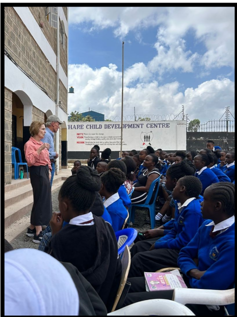
Here we are addressing the 7-8-9th grade students who make up the new Jr. High school. Notice their new uniforms!

According to Lk. 15:10 , the angels in heaven were rejoicing!