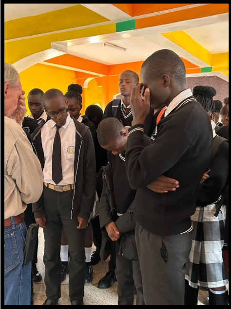
These are the High School kids that came forward to pray the prayer of salvation and receive Jesus Christ as Lord and Savior!