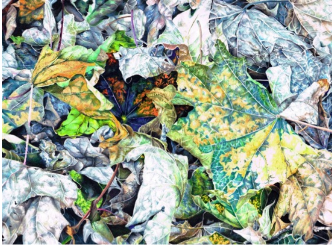
Best of Show: "Leaves" by Phil Schorn