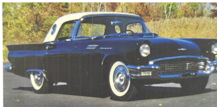
Phil Guidone's 57