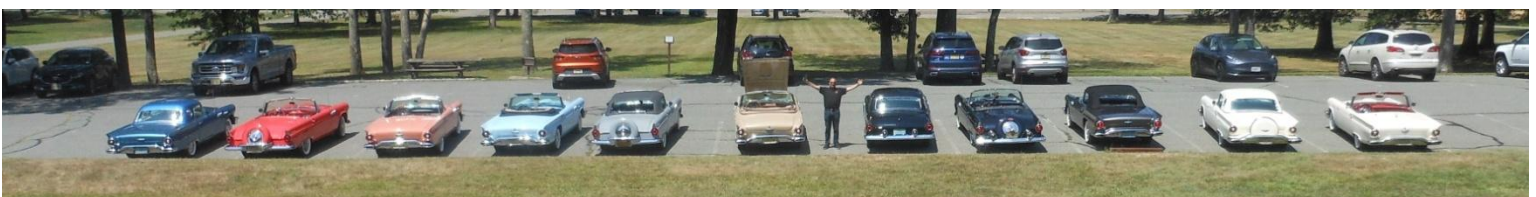
A complete set of picnic pictures are on the web site.