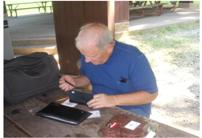
Treasurer's job is never done.