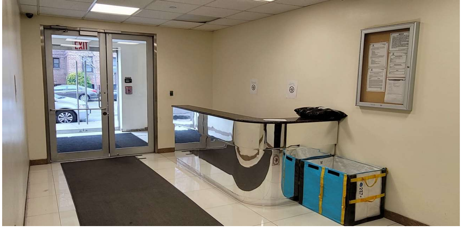
BUILDING HALLWAY ON 1<sup>ST</sup> FLOOR (NOTE ELEVATOR AND 2 SEPARATE STAIRCASES