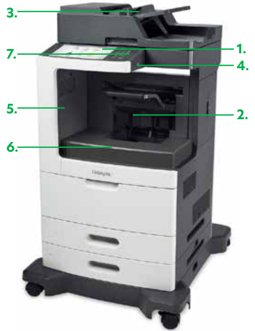
XM7170 model configured with Staple, Hole Punch Finisher

Choose from multiple output options, including a four-bin mailbox, an offset stacker, a staple finisher and a staple with hole punch finisher.