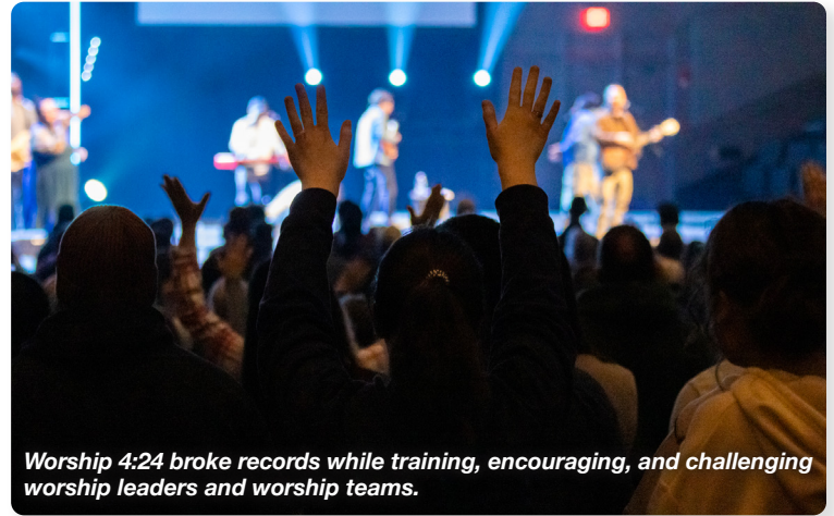
Worship 4:24 broke records while training, encouraging, and challenging worship leaders and worship teams.

The chapel was filled with worshipers, and if you couldn't make it, you missed something awesome. Charity Gayle,