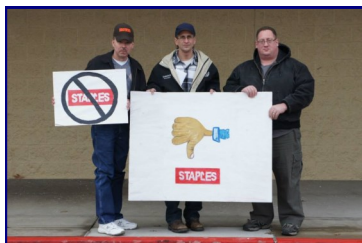
Youngstown Area Local

And when you do have to buy something that is not made in the USA, I suggest making a selection of an item that was never made in the USA so that you don't reward the American conglomerates who sold us all out. It is about time that we stop "letting it happen". Make the effort to buy American, and Union. Take the time. Spend a little more. Or do without it! The job and way of life you are protecting is your own. If we don't care, who will?