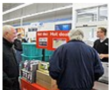
Retirees and Auxiliary