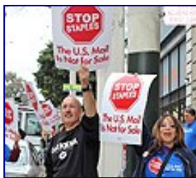
San Francisco Local