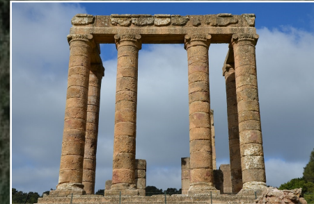
Ancient Temple PLEIADES CITY