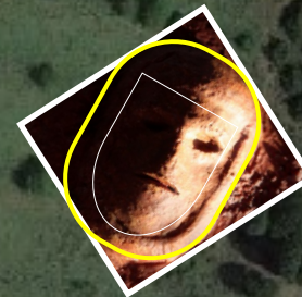
Ancient Ruin FACE OF ALA-LU

MARTIAN PATTERN 40°44'33.60N 09°27'40.29W CYDONIA, MARS