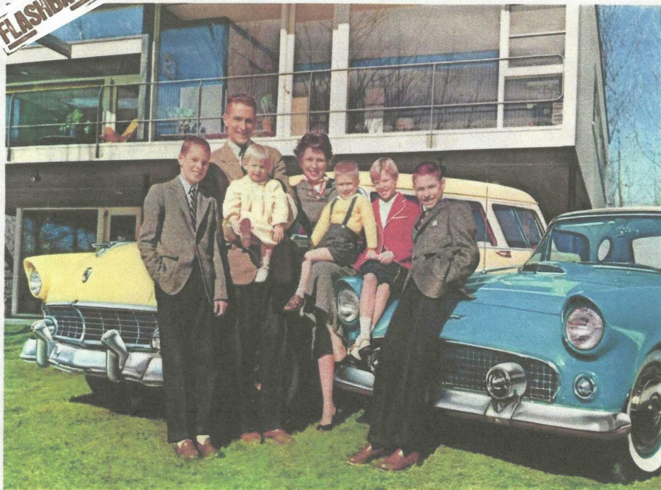
The only problem in posing this picture was getting the two Fords to stand still.