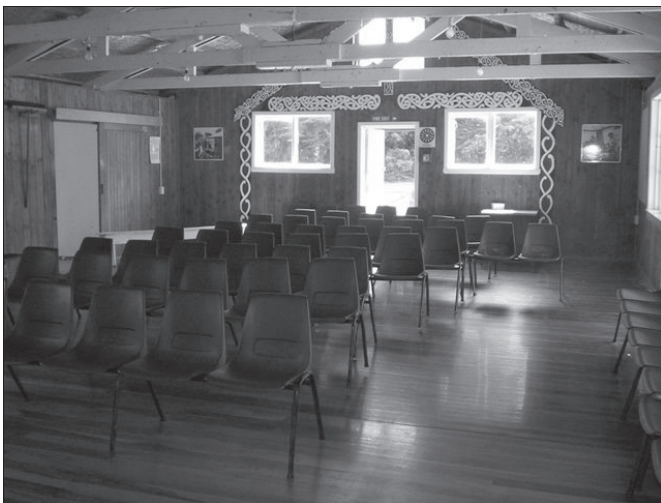
Interior of the Maire Lodge, where the project work will be done.

The application form to attend this camp is enclosed with this newsletter with all the details.