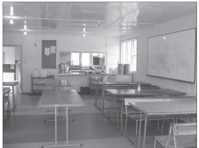
Interior of Dining Room looking through to the kitchen.