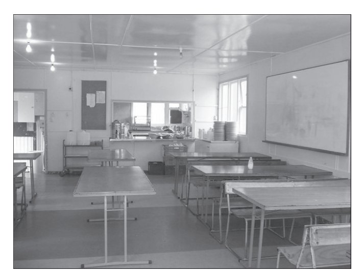
Interior of Dining Room looking through to the kitchen.

The application form to attend this camp is enclosed with this newsletter with all the details.