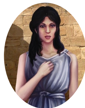
Feast Day: March 7