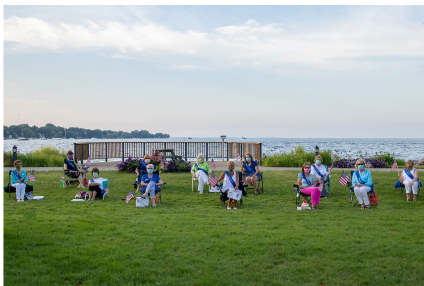
SIGP's new Board Members. We're all hoping that they'll be unmasked and sitting more closely together in the next group photo of them.