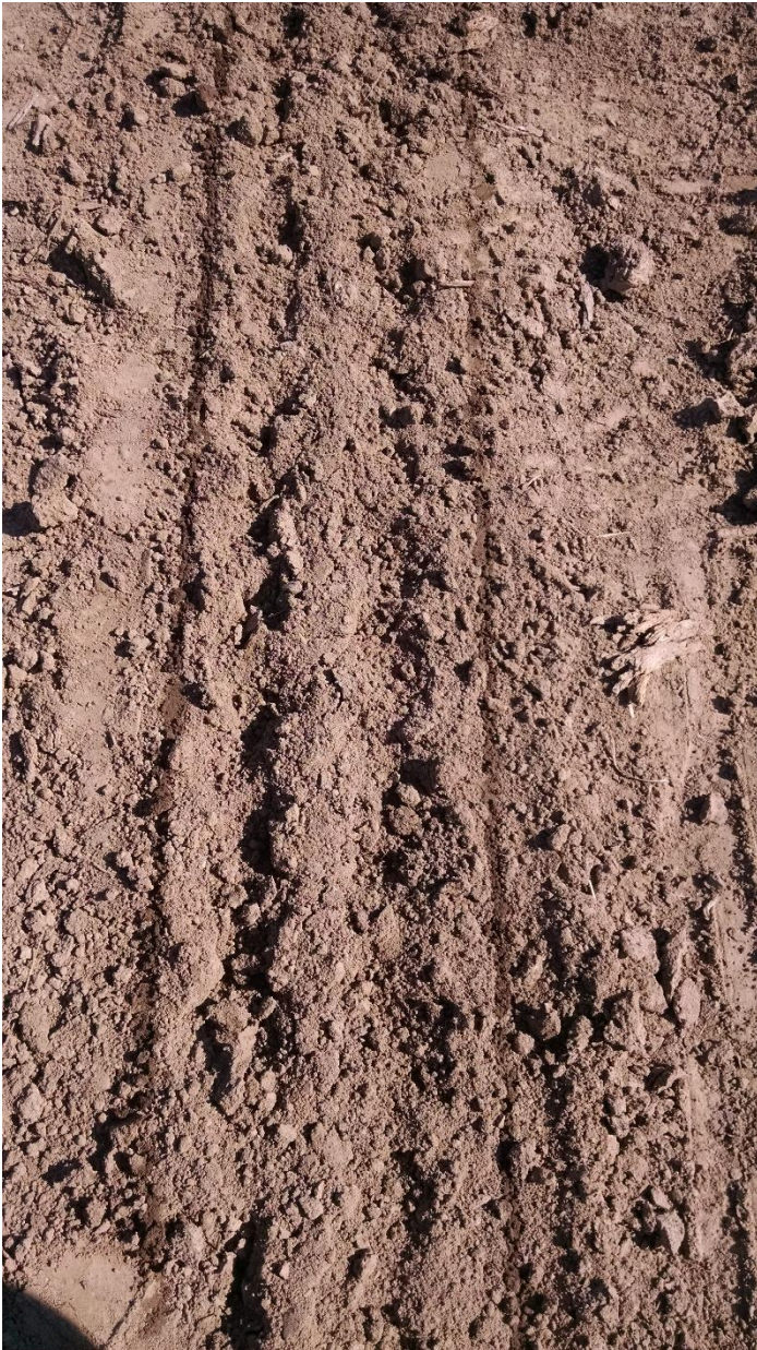
20 GALLONS PER ACRE (BOTH SIDES)