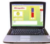
◀ Model H-DHPS-CSI