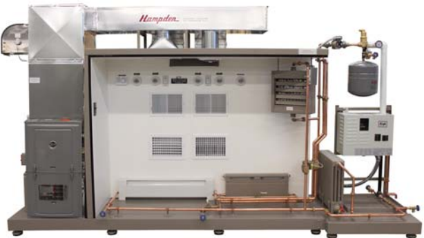
Model H-AHST-D3 Air/Hydronic: Gas/Electric with Summer Air