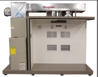
H-FAHT-1-G-A Forced Air Heating Trainer with Summer Air