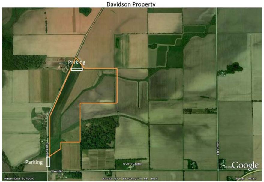
Park on the blacktop Roads, Next to Hunting areas. No Parking in fields or Dirt roads. Walk into all fields.