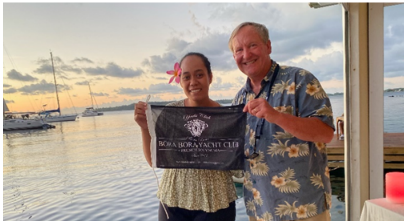
Burgee exchange with the Bora Bora Yacht Club, Terry's 150th conquest