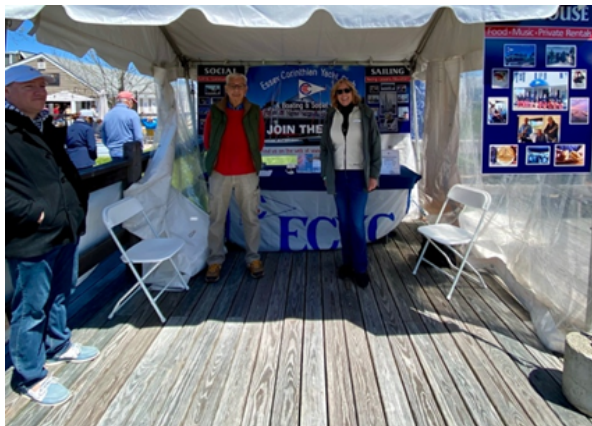
ECYC recruiting booth at the Boat Show