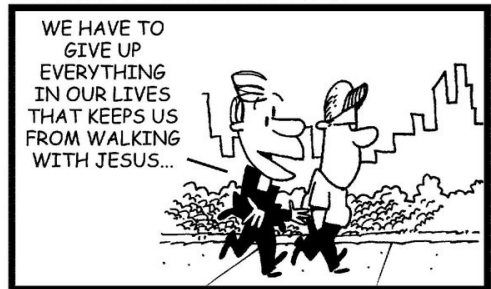
28th SUNDAY IN ORDINARY TIME