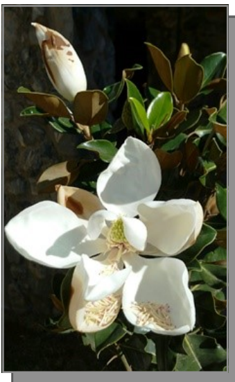
1st flower on a new tree