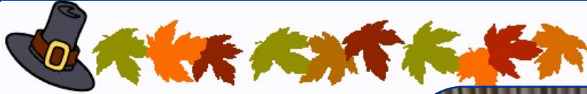
TABLE OF PLENTY THANKSGIVING PHOTO GALLERY