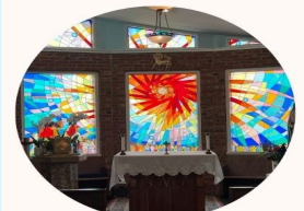
Marian Shrine @ St. Joseph Bowling Green