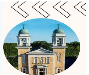
St. Francis de Sales Paducah