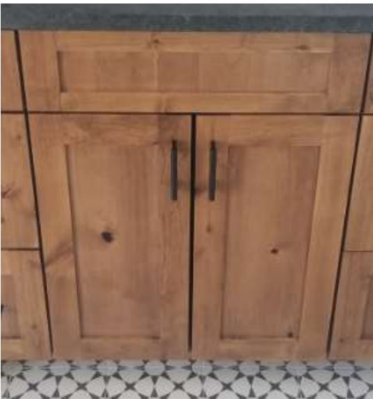
Stain Grade Shaker