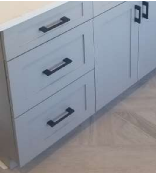
Paint Grade Shaker Style

We offer stain grade and paint grade options. Our paint grade doors are constructed out of a CNC milled solid piece of HDF which eliminates all seams and provides a very smooth finish at an affordable cost. Stain grade shaker & slab doors are milled in house. Mitered and Raised panel doors are ordered from TaylorCraft doors in Taylor, TX. TaylorCraft options: https://taylorcraftdoor.com/