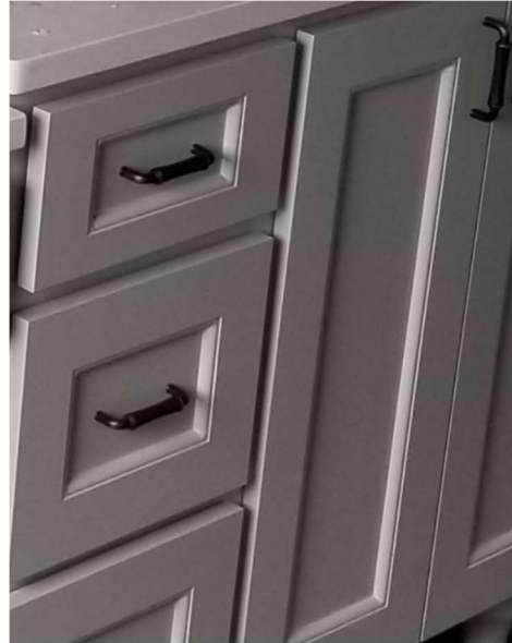
Paint Grade Beaded Shaker