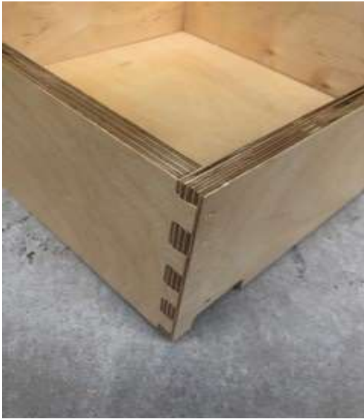
Soft Close Options

Our normal close slides are full extension and ball bearing. Our soft close slides are also full extension. Both slide options are rated for 100 lbs.