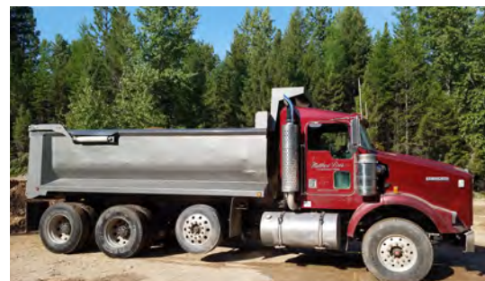
#4 Load of gravel. Delivery included within a 25 mile radius of mile-marker 37, Highway 83. Value $220. Donated by Matthew Brothers Construction. Green ticket.