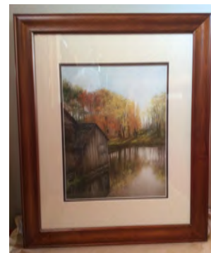
#2 Lynne Perry painting, donated by Lynne Perry, Value $300. Blue ticket.