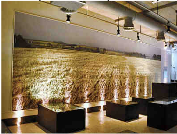
Reception Desk / Corporate Lobby