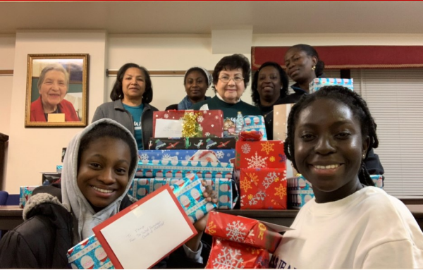
Gift wrapping and distribution team