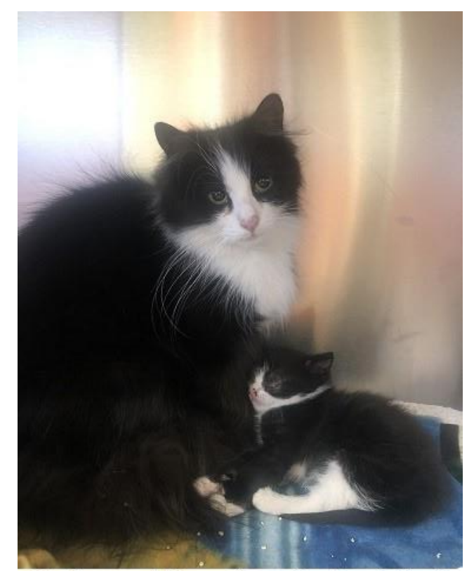
Mother and kitten from Rachael Circle