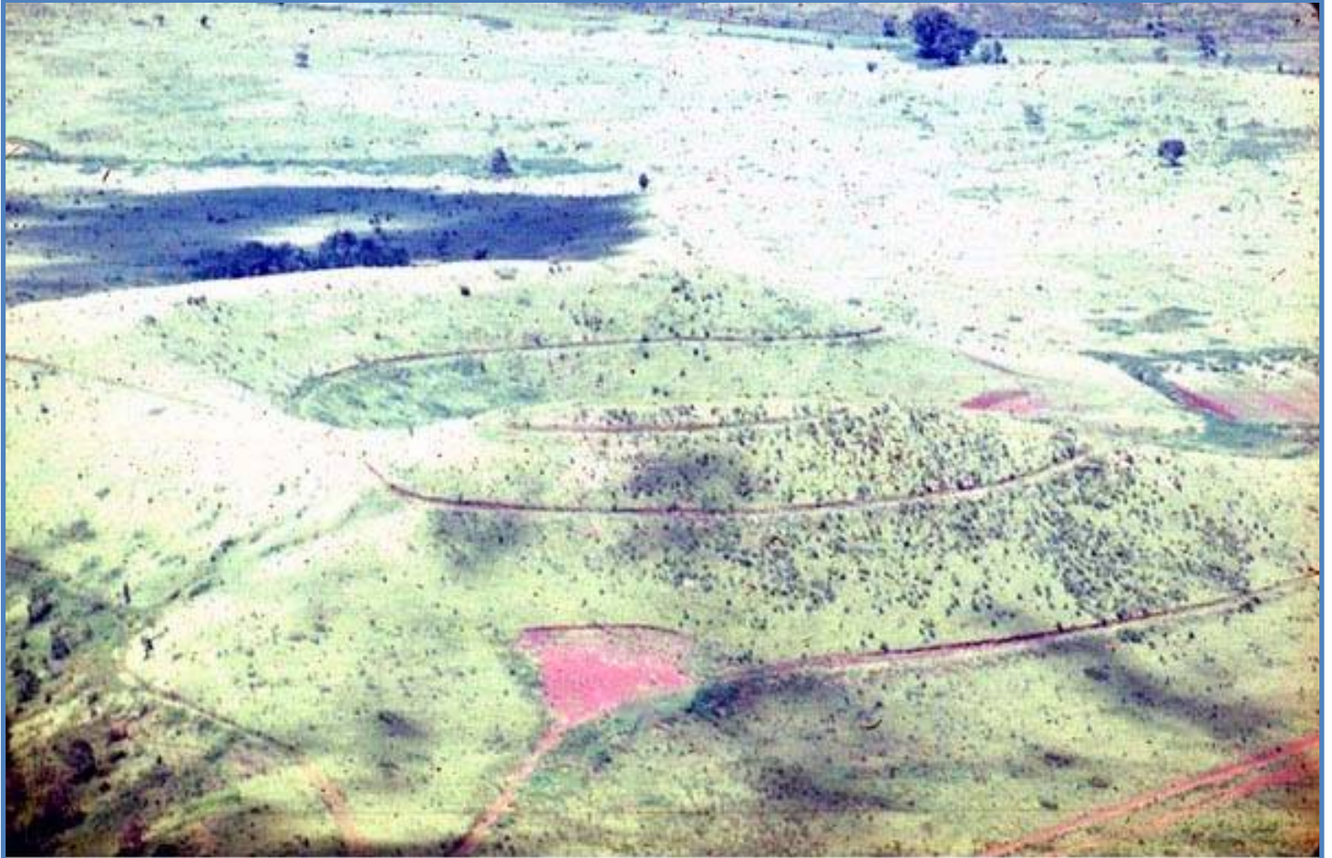
The road up Dragon Mountain.