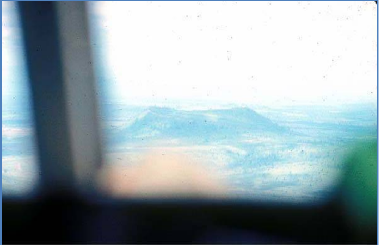
Another closer view of Dragon Mountain