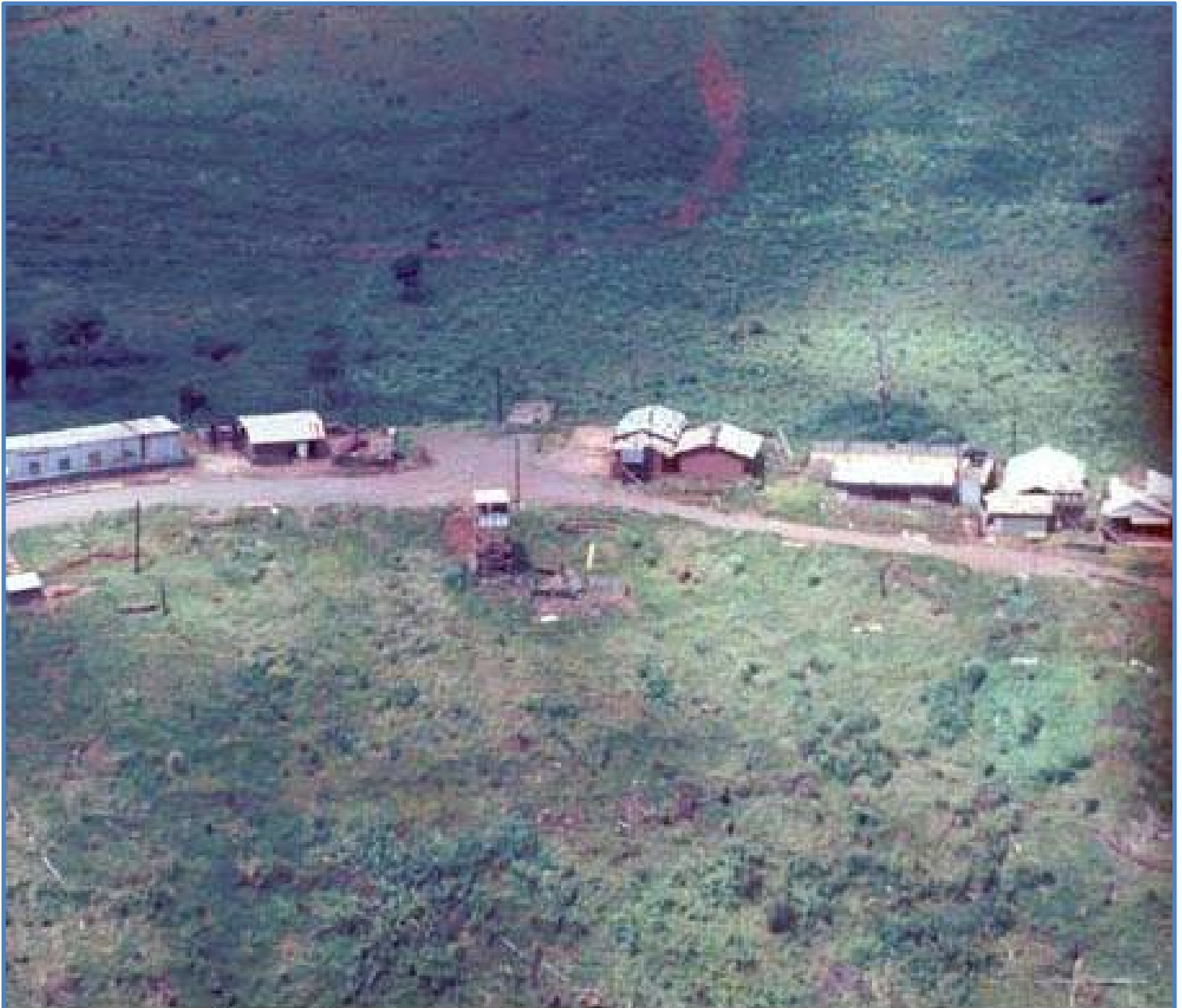
Another shot of AFVN Det. 3 atop Dragon Mountain.