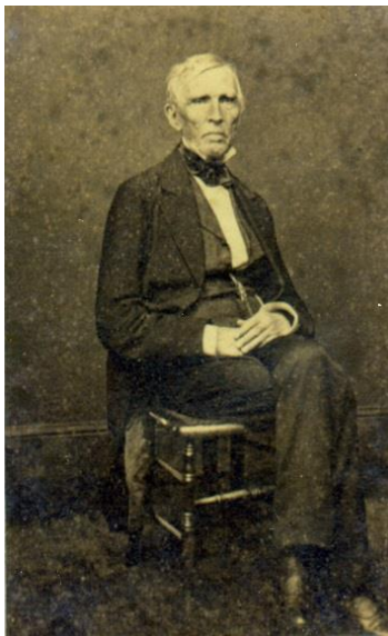
John J. Crittenden (1787-1863)

But the leading contender is a very ambitious proposal set forth by the Border State member, John J. Crittenden of Kentucky, the most senior statesman present and the one man most determined to find a way to save the Union.