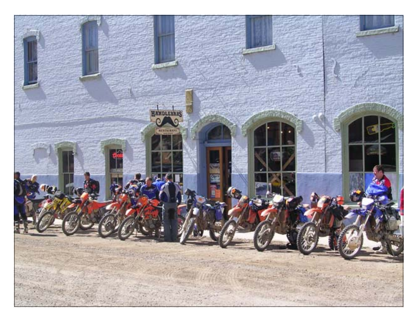
OK, I admit it. I had this space to fill up and I just copied this picture from the Colorado 500 in here to fill up space quick. This is the way to go to lunch. Ride to the restaurant on your dirt bike. We are in Silverton, CO at the Handlebars restaurant.