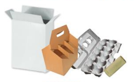
Boxboard (Dry-food boxes, egg cartons, & rolls)