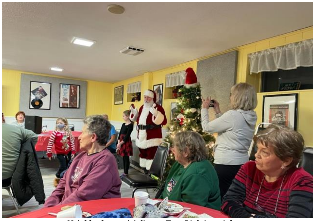
Neighborly conviviality on Tree Lighting night