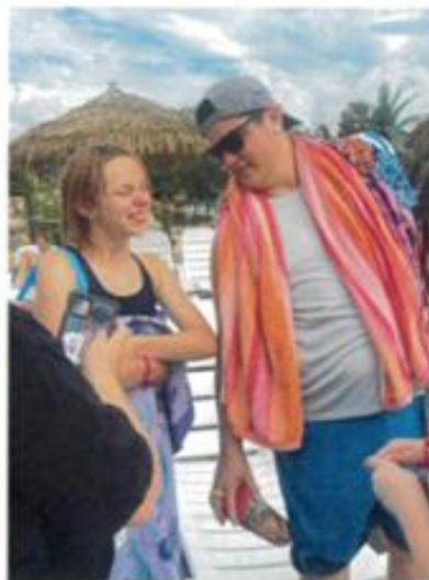
I wasn't that scared...