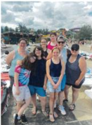
Quick pic B4 the FUN!

Flexibility was our theme this summer! While we initially planned a trip to Back Bay Mission, we chose to stay closer to home to ensure everyone felt safe and secure, given the national climate. This pivot led us to the "Best Little Water in the Midwest", Lost Island in Waterloo, IA! It was a fantastic trip filled with laughter, water slides, and a lot of sunscreen. It reminded us that mission and fellowship aren't just about the destination, but the joy we share along the way.