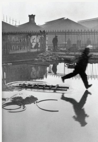
Henri Cartier-Bresson Retrospective at the Pompidou Centre, Paris