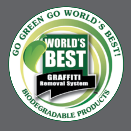
Learn more at graffitiremovalinc.com