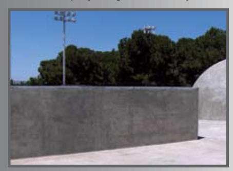
Congratulations City of Fresno Graffiti team!