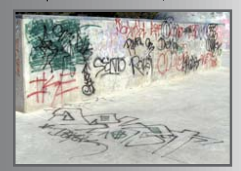
Sunbaked spraycan graffiti over 1 year old