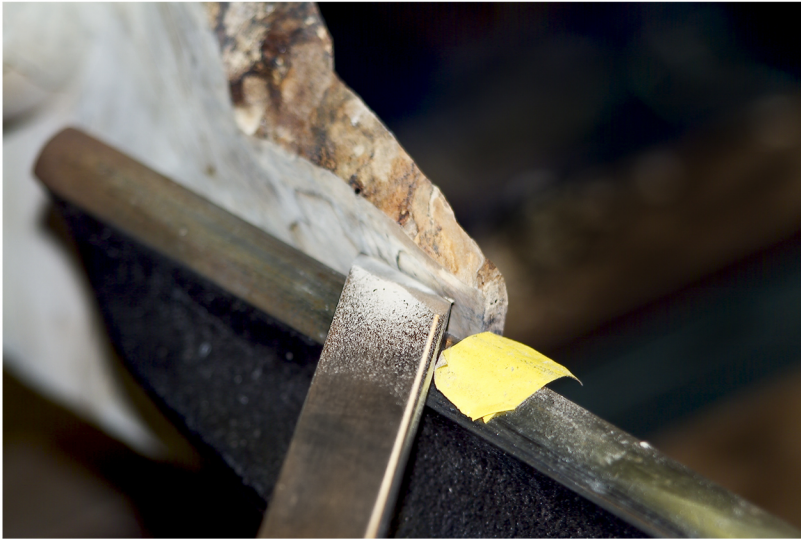
Photo at left shows negative rake scraper being used to make finishing cuts, smooth out wing and clean up tool marks.

HINT: Don't use a regular scraper on the wing they are usually too grabby ( the results can be explosive ).