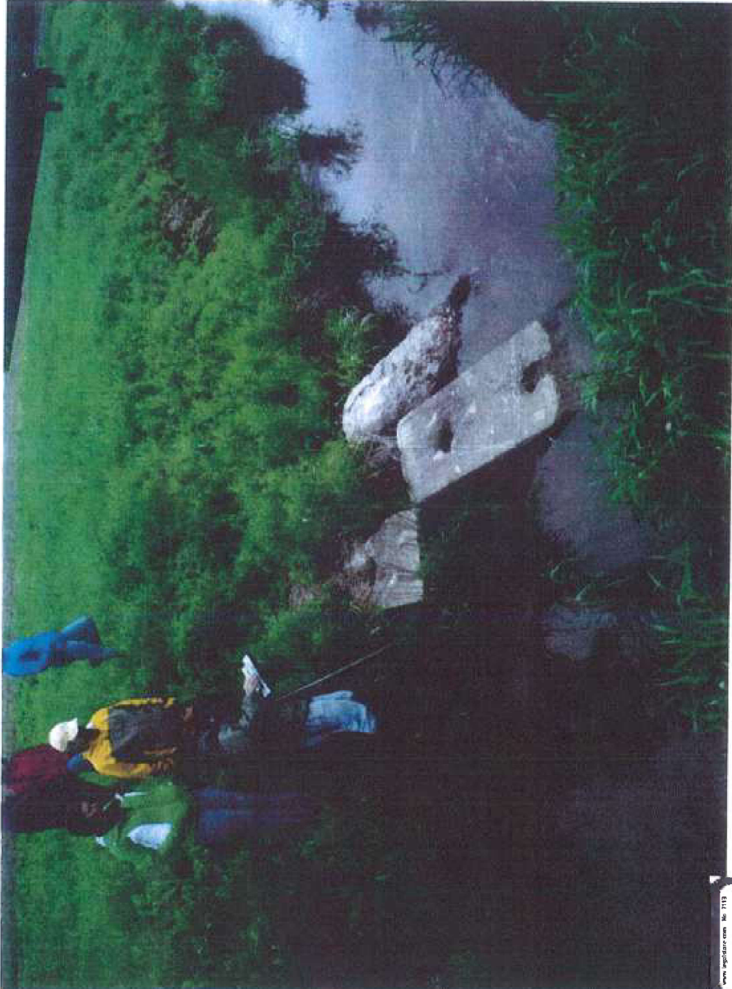
Photo # 12 Photo Id: DSCF0072 Date: 05/20/2015 Location: 41° 58 594 N 80° 02 366 W Notes: Photo of check dam. Facing North.